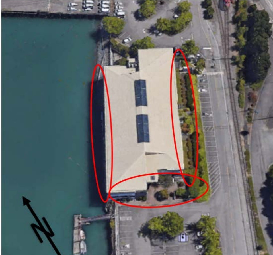
Figure 2: East, West, and South/Front side of the Administration Building

The Port's Administration Building security needs to be updated / improved both on the inside and outside. This will include upgrading the front building doors, and installation of additional cameras inside the building. The lighting and cameras facing the shoreline on the westside, the front of the building and East parking lot will also need to be upgraded or new cameras and lighting will need to be installed. Port Administration Building is shown in Figures 2 and 3 below.