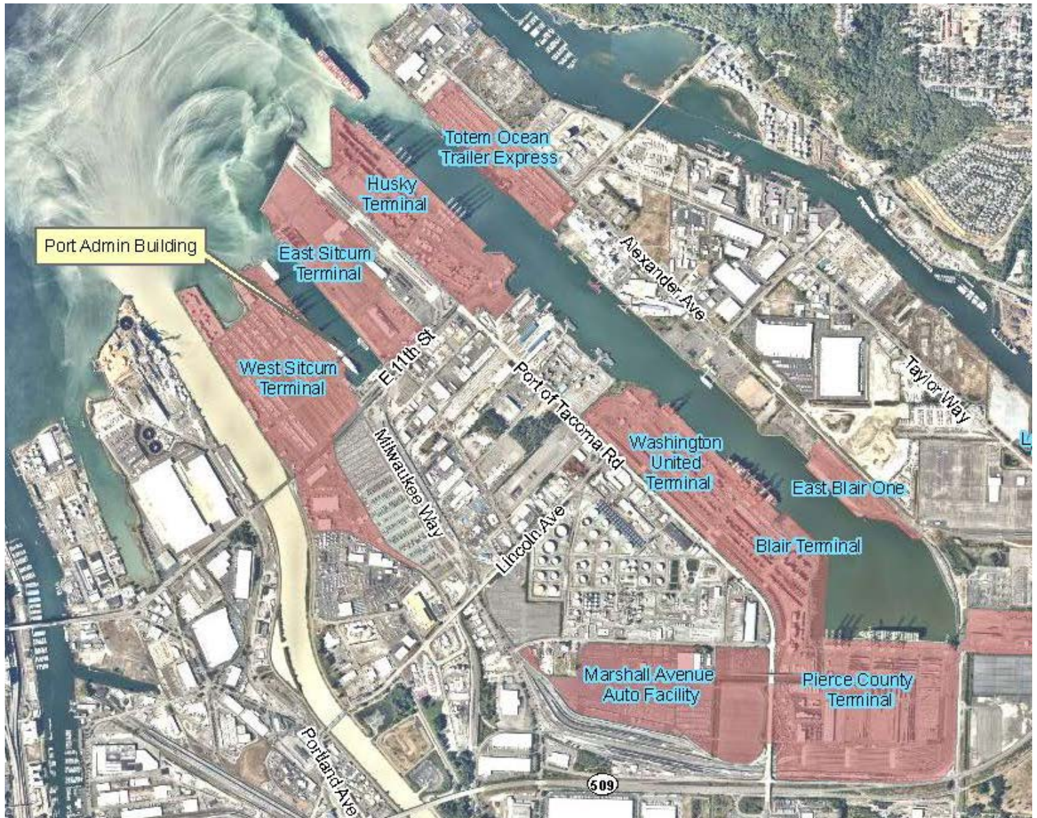
Figure 1: Project Map