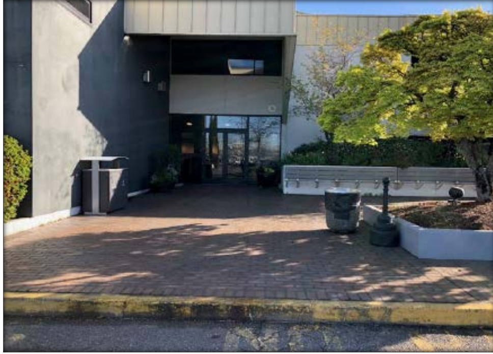
Figure 3: Front of Administration Building