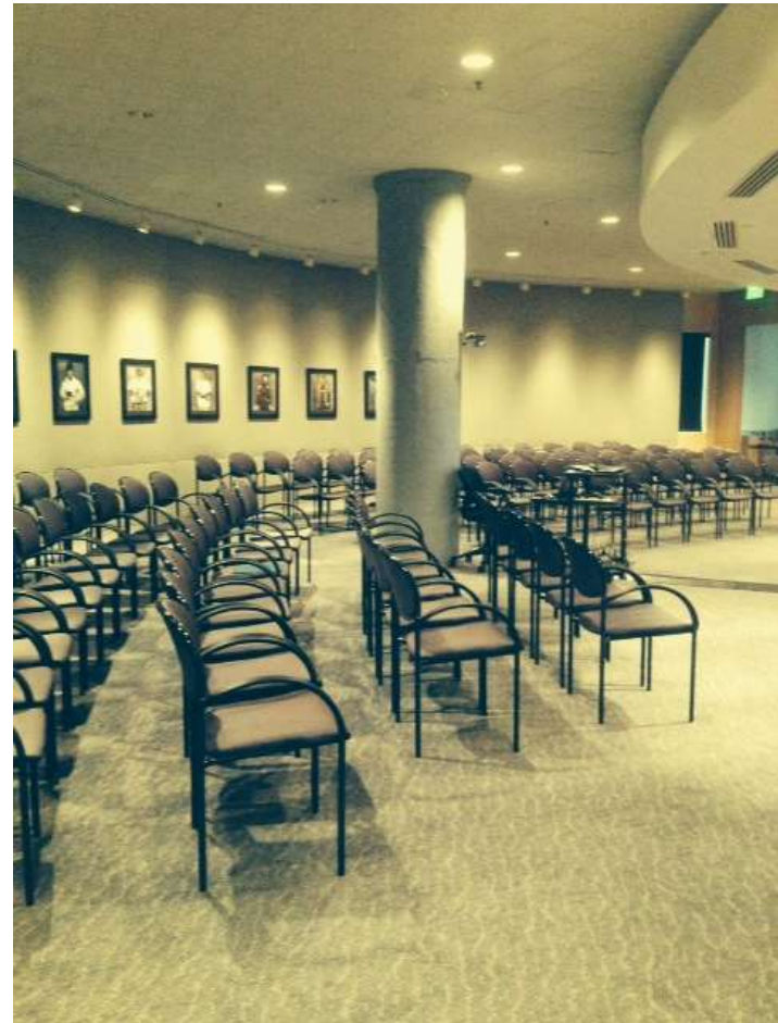
Photo of the entrance to the commission chambers.